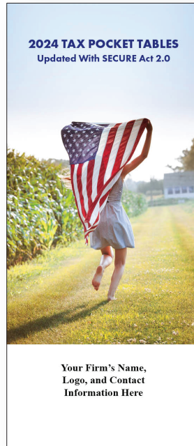
Cover B Field of Dreams