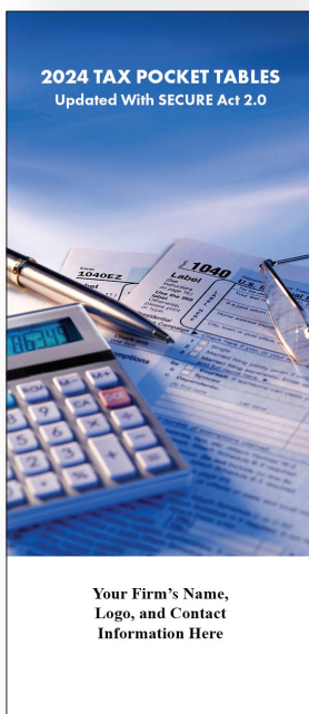
Cover D Blue Calculator