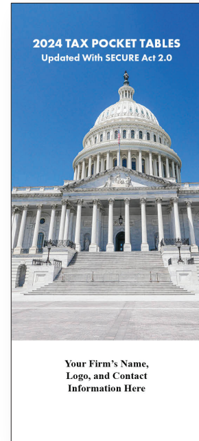
Cover C US Congress