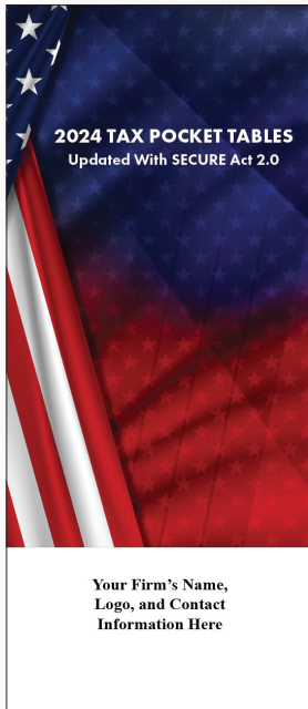
Cover A Old Glory