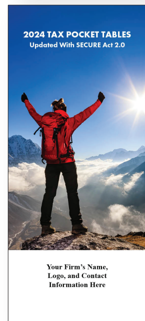
Cover F Mountain High