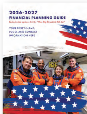
B. Artemis II Crew