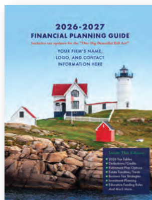
E. Red Roof and Lighthouse