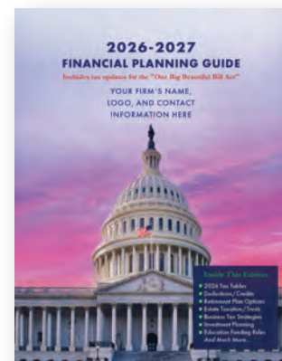
C. Congress At Dusk