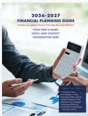
D. Desktop Calculator